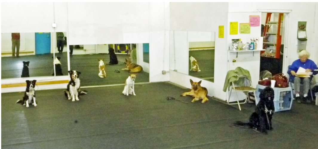
Lora Cox's Tuesday morning class.