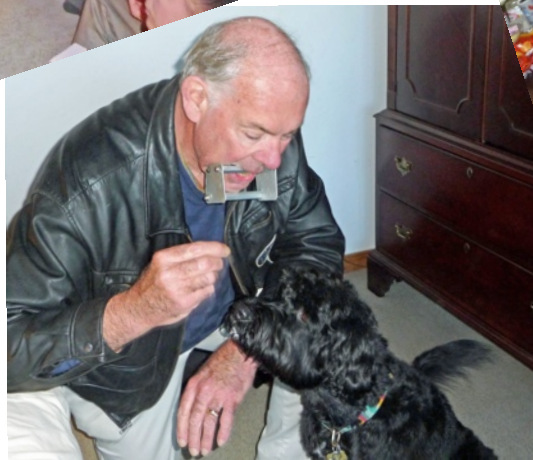
Teaching Bingo to pick up those yucky metal articles